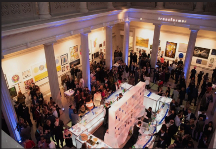
Image Credit: Transformer's 15th Annual Auction at the GWU/Corcoran School of Art & Design, 2018.

CELEBRATING 20 YEARS OF TRANSFORMER'S WORK AS A CATALYST AND ADVOCATE FOR EMERGING ARTISTS & EMERGENT EXPRESSION IN THE VISUAL ARTS!