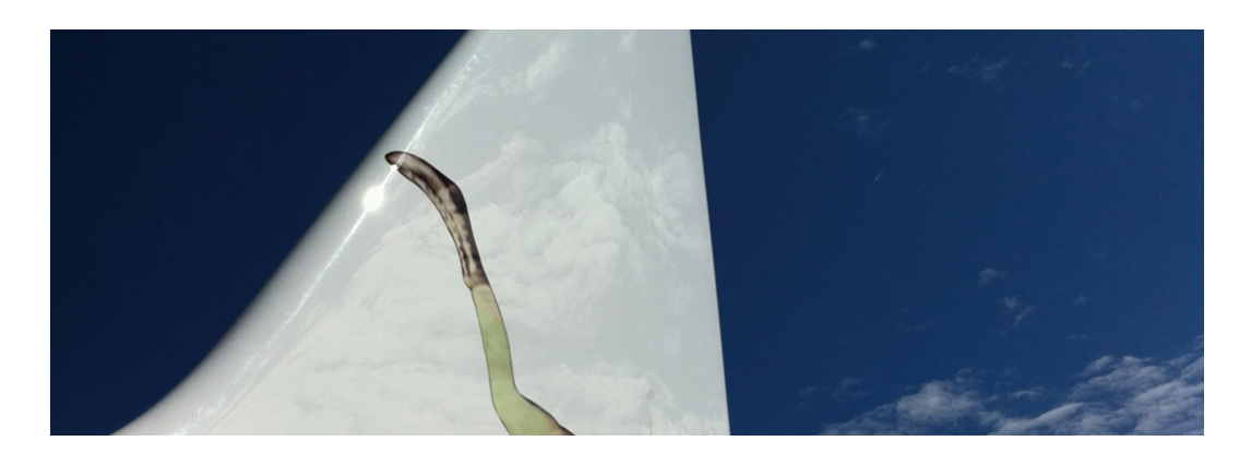
Thursday, February 16, 2012; 4:30 - 6pm

FRAMEWORK Panel #15 2:46 and thereafter - Japanese Artists' Responses to the March 2011 Earthquake & Tsunamis