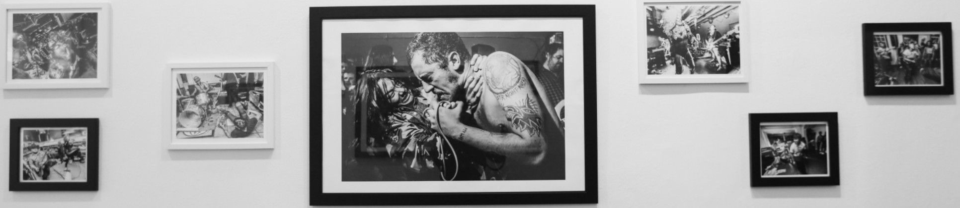
Exhibition detail of Farrah Skeiky, Present Tense: DC punk and DIY, Right Now: Transformer's 17th Annual DC Artist Solo Exhibition , 2020; photo by Farrah Skeiky.